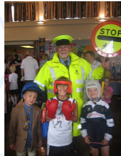
Sporting Summer Fair

former pupil, have had children and grandchildren at the school in the past, or simply be interested in school life – whatever your connection, we would love to hear from you.