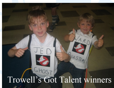
Trowell's Got Talent winners

The current Friends of Trowell School committee has raised thousands of pounds in its term in office and the officers now wish to step down. Whilst there is a lot of goodwill to Friends of Trowell School, and support at events, nobody wishes to take office... perhaps you can help?