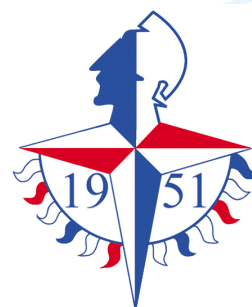
Festival of Britain Village 1951 Motto: "Independence and Self Help"

The council would like to place on record the sterling contributions made over the years by the departing councillors, and wish them all the best for the future.