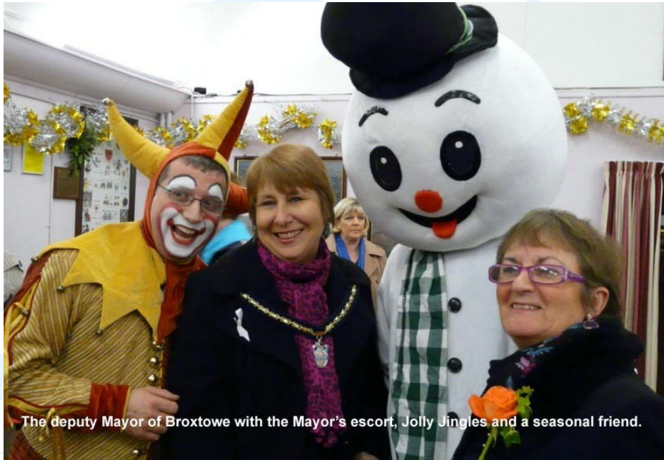
The deputy Mayor of Broxtowe with the Mayor's escort, Jolly Jingles and a seasonal friend.

Yet again a very successful evening, and thanks must go to all those members of the Festival Committee who put in such a splendid effort every year. Although